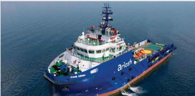
ARIOSH OSHE VESSEL