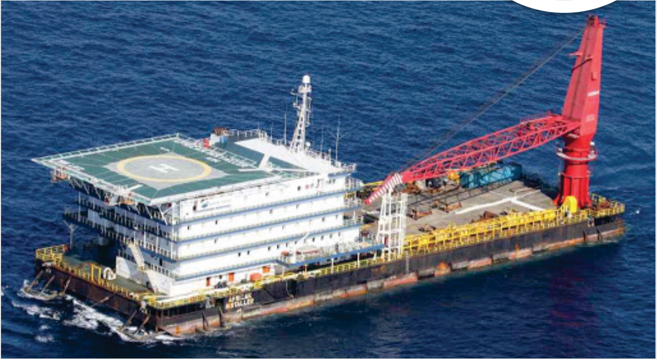
AFRICAN INSTALLER 2