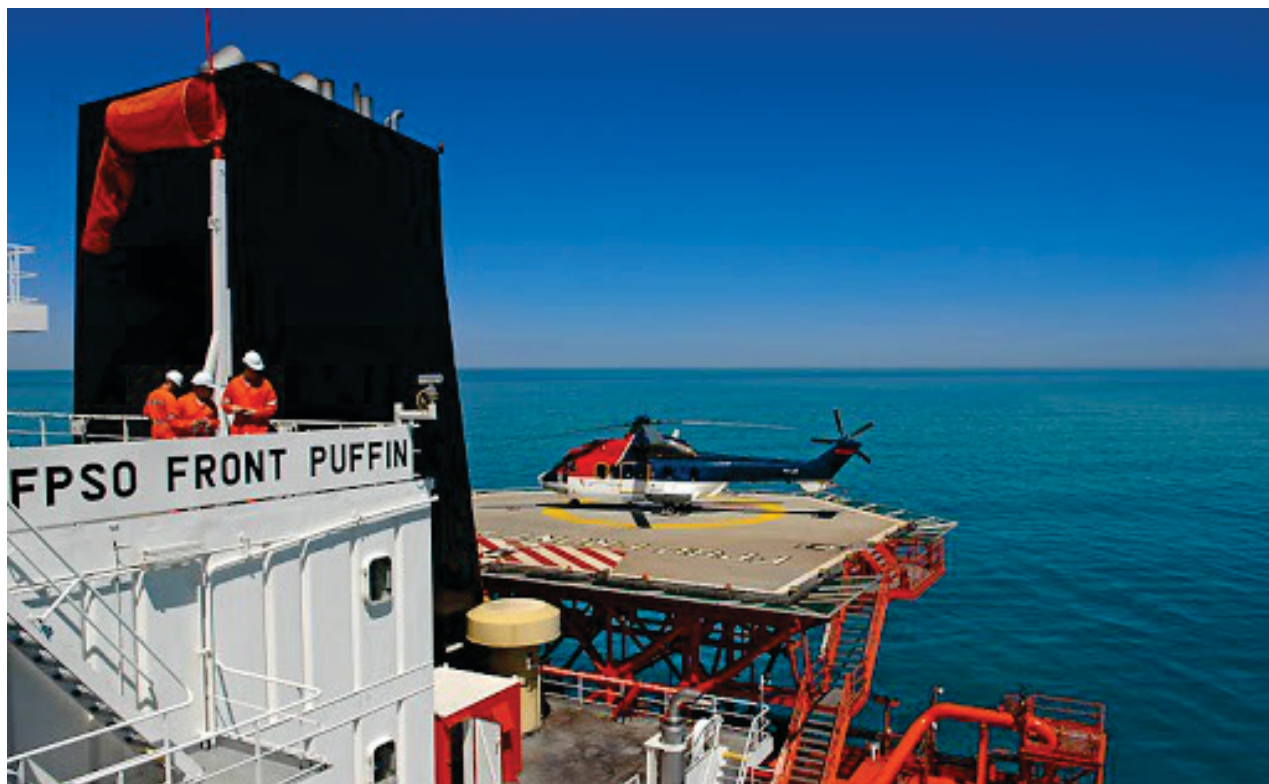
FPSO FRONT PUFFIN